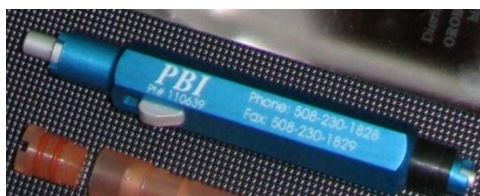
Figure 2: The Shredder-Tube Cap Tool.

After evenly distributing the small tissue pieces on the Lysis Disk at the narrow Ram side of the Shredder-Tube, a serrated Shredder-Ram is inserted with a twisting motion to press the sample between the serrated surface and the Lysis Disk by using the Shredder-Tube Cap Tool ( Figure 2 ).