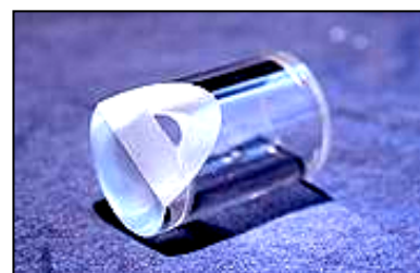
Duran glass O2k-Chamber

The O2k-Chambers are made of Duran glass and are closed by PVDF or PEEK stoppers which are as diffusion tight as titanium stoppers. The magnetic stirrer bars are coated by PVDF or PEEK. Teflon with its high oxygen solubility is avoided ( Gnaiger 1995 ). Viton O-rings are used for sealing the stoppers. Butyl rubber gaskets provide the seals for the oxygen sensors. These sealing materials minimize oxygen diffusion into or out of the experimental chambers.